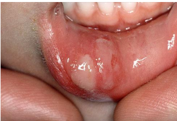
Oral Aphthous ulcer

http://www.aafp.org/afp/2002/0915/p991.html